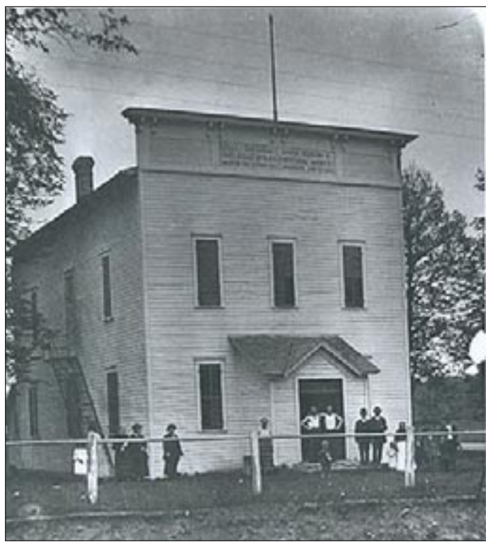
The old Bohemian Hall, which was located between Silver Lake and Hutchinson on Highway 7.

By 1882, the society had grown to 50 members; it was decided to build a hall of their own. They bought an acre of land at the corner of State Highway 7 and County Road 4 for $60. The dimensions were 30 by 52 feet by 16 feet high and was first used on Nov. 10, 1883. In 1895, a second story was added with a stage and a dance floor. The first floor contained a large lodge room, a kitchen, a dining room and